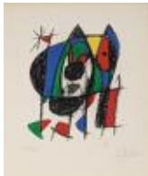
16 Joan Miró (Spanish, 1893-1983), Lithographs II: one plate (M.1041) (small one with triangle), lithograph, 1975, signed in pencil, numbered XXXVI/LXXX, 30.5cm x 24cm, full sheet 45cm x 37cm, Unframed ARR