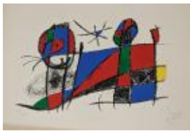
15 Joan Miró (Spanish, 1893-1983), Lithographs II (M. 1042), 1975, lithograph, signed in pencil, edition LV/LXXX, on Arches paper, 31.5cm x 48cm, full sheet 45cm x 61.5cm, Unframed ARR