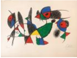
19 Joan Miró (Spanish, 1893-1983), Lithographs II: one plate (M.1045), lithograph, 1975, signed in pencil, numbered LV/LXXX, on Arches paper, 30cm x 49cm, full sheet 45cm x 61.5cm, Unframed ARR