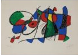
14 Joan Miró (Spanish, 1893-1983), Lithographs II: one plate (M.1044), 1975, lithograph, signed in pencil, numbered XXXVI/LXXX, on Arches paper, 30.5cm x 47.5cm, full sheet 45.5cm x 61.5cm, Unframed ARR