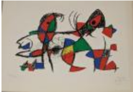
20 Joan Miró (Spanish, 1893-1983), Lithographs II: one plate, lithograph, 1975, signed in pencil, numbered XXXVI/LXXX, on Arches paper, 32cm x 48cm, full sheet 45cm x 61.5cm, Unframed ARR