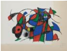
22 Joan Miró (Spanish, 1893-1983), Lithographs II: one plate, lithograph, 1975, signed in pencil, numbered XXXVI/LXXX, on Arches paper, 32cm x 46cm, full sheet 45cm x 61.5cm, Unframed ARR