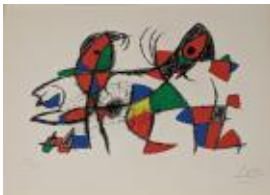
21 Joan Miró (Spanish, 1893-1983), Lithographs II: one plate, lithograph, 1975, signed in pencil, numbered LV/LXXX, on Arches paper, 32cm x 48cm, full sheet 45cm x 61.5cm, Unframed ARR