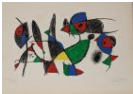
18 Joan Miró (Spanish, 1893-1983), Lithographs II: one plate (M.1045), lithograph, 1975, signed in pencil, numbered XXVI/LXXX, on Arches paper, 30cm x 49cm, full sheet 45cm x 61.5cm, Unframed ARR