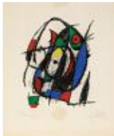
17 Joan Miró (Spanish, 1893-1983), Lithographs II: one plate, lithograph, 1975, signed in pencil, numbered XXXVII/LXXX, on Arches paper, 32cm x 24cm, full sheet 45cm x 37cm, Unframed ARR